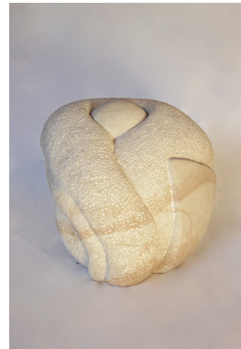
Sandstone sculpture , 2007