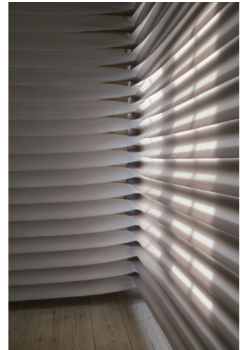
Thesis project, Fluid Space