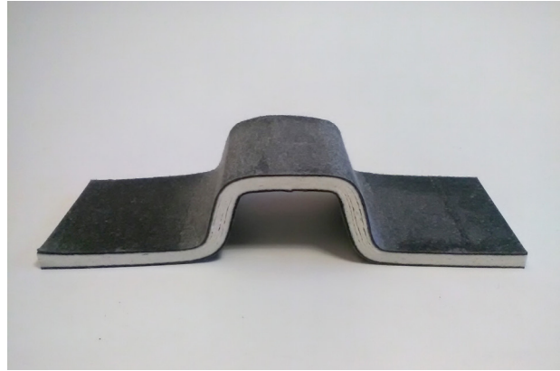
Material research project, exploring the properties of Really. At heat and pressure, the material can be transformed into hard shells that hold its shape, 2017.